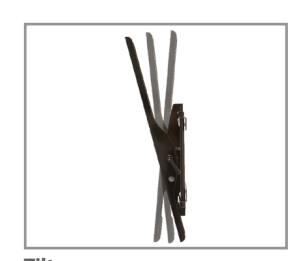
Tilt 15° forward and 5° back tilt for optimal viewing angles.