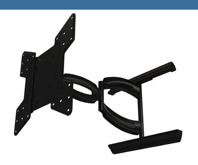
Articulating mount for 32" to 75" displays. Multiple joint arm holds display 3.5" from wall when retracted and 27" when fully extended. Smooth tilt adjustments of +15^{\circ} (forward) and -5^{\circ} (back) with a locking knob and 3° side-to-side roll facilitates a variety of viewing angles and perfect positioning. Integrated cable management for clean look.