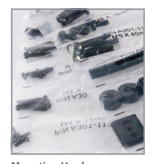
Mounting Hardware Complete set of mounting hardware, labeled for ease of use and ready to go.